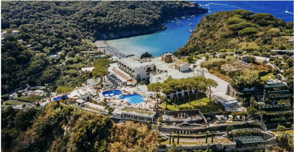
– San Montano Resort & SPA –

Beyond the Celebration: Discovering Ischia – One of the joys of choosing Ischia as a wedding destination is the opportunity it offers to transform a single day into a multi-day experience. Guests can indulge in the island's renowned thermal spas, stroll through La Mortella gardens, or take a private boat tour around the coastline, discovering hidden coves and crystalline waters. Wine lovers can explore local vineyards that produce Biancolella and Forastera, while food enthusiasts can enjoy authentic trattorias and gourmet dining options alike. Proximity to Naples, Capri, and the Amalfi Coast makes Ischia a perfect hub for extending the celebration into a honeymoon or family gathering. For couples seeking a destination that is at once glamorous, authentic, and accessible, Ischia, and in particular, the Lighthouse Suite at San Montano Resort, offers a revelation.