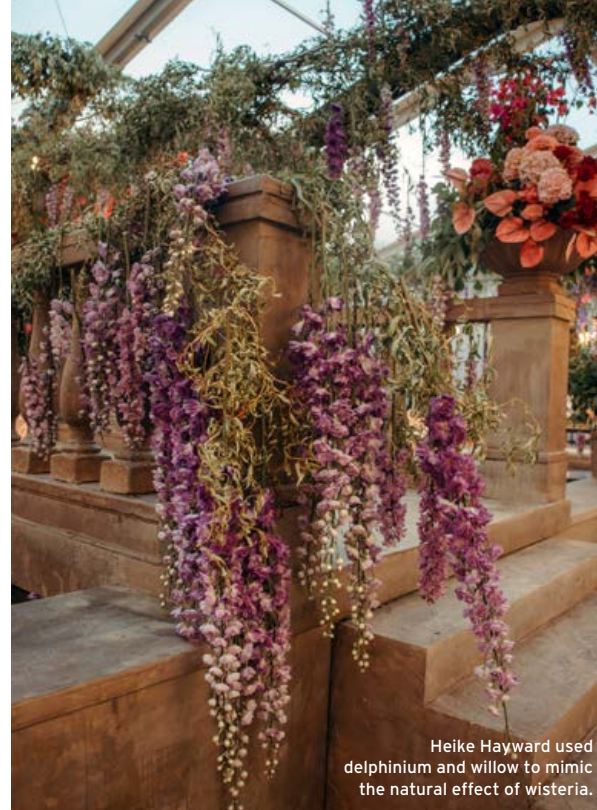
Heike Hayward used delphinium and willow to mimic the natural effect of wisteria.

“The superstar of European floral decor. There is no such thing as enough, and no detail is too small. Roni and his team are very flexible and accommodating—a true pleasure to collaborate with.” roni-floral-design.com