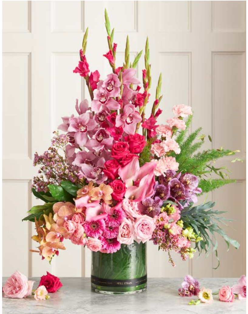
Neill Strain's "Pretty Pinks" arrangement of seasonal blooms