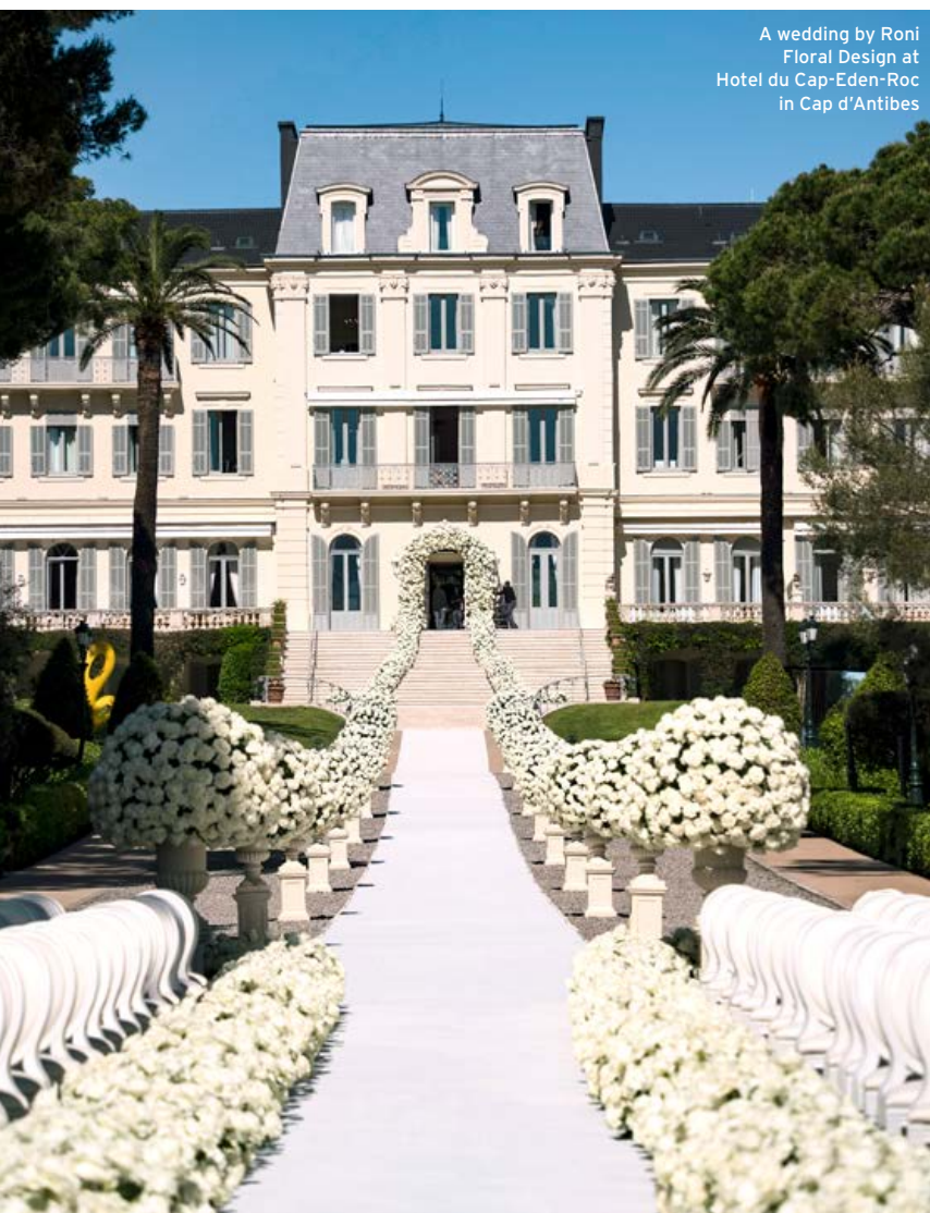
A wedding by Roni Floral Design at Hotel du Cap-Eden-Roc in Cap d’Antibes